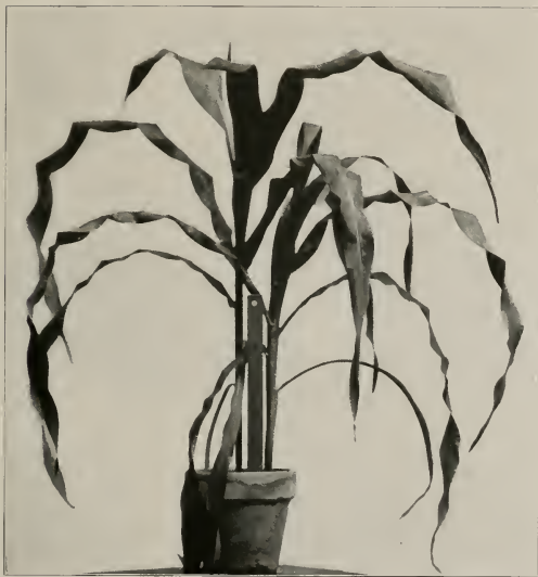
Plants grown from grains of Zea mays immersed in kerosene from February 6, 1906, to February 6, 1914. On removal from the kerosene the grains were cleared of superficial oil by means of absorptive towels, and then washed vigorously for five minutes in chloroform and exposed to dry air at room temperature for five days. They were planted February 11, 1914, and this photograph was taken April 22, 1914.