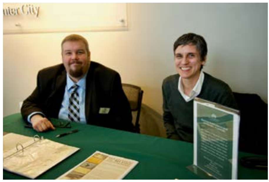
Figure 3: Special Collections faculty showcase Atkins Library archives at Beyond the Myths: The Civil War in History and Memory event.

The partnership with Charlotte Mecklenburg Library allowed us to tap into the marketing expertise of a large organization, dramatically increasing the outreach possibilities and reaching a varied audience. This also drew more visitors to Atkins Library, allowing patrons to peruse a very different collection from that of the public library. Atkins' Special Collections department played a large role in each event, staffing a display table with copies of historic