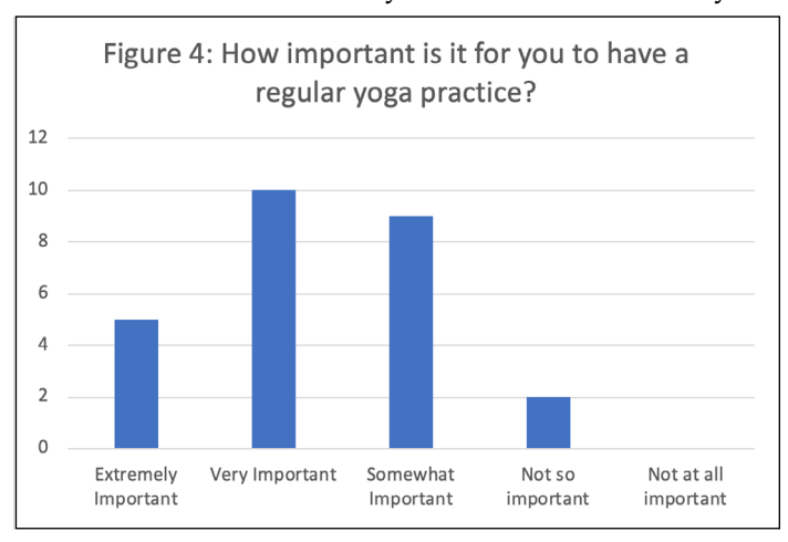
Figure 4. Importance of Yoga Practice.

When asked how important it was to have a regular yoga practice, 15 respondents said "extremely important" or very "important" (Figure 4). Twenty also mentioned that they have participated in yoga at studios or online before coming to the #WellnessWednesdays sessions, and five had not