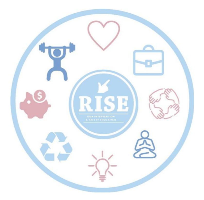
Figure 1: Texas Tech University's wellness wheel, RISE

situating academic libraries within other outreach initiatives. While primarily used in student affairs or other university departments, the wellness wheel shows facets of a well-balanced life. Texas Tech University's Risk Intervention and Safety Education (RISE) wellness wheel (Figure 1) displays the following facets of student wellness: emotional, occupational, social, spiritual, intellectual, environmental, financial and physical. The word "wellness" in academic student services spaces centers on the development of the whole person, so that wellness encompasses not only physical health, but also the importance of managing stress and emotions effectively and engaging positive relationships with others (Parker and Dickson 2020).