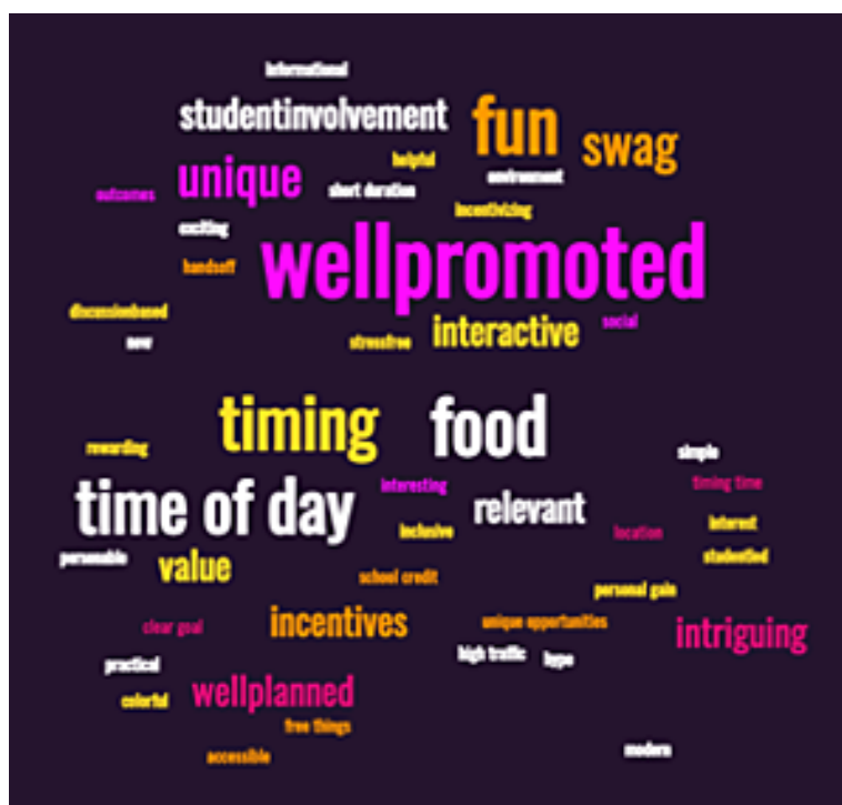
Figure 1. Word cloud with characteristics of effective outreach identified in the coded listing exercise.