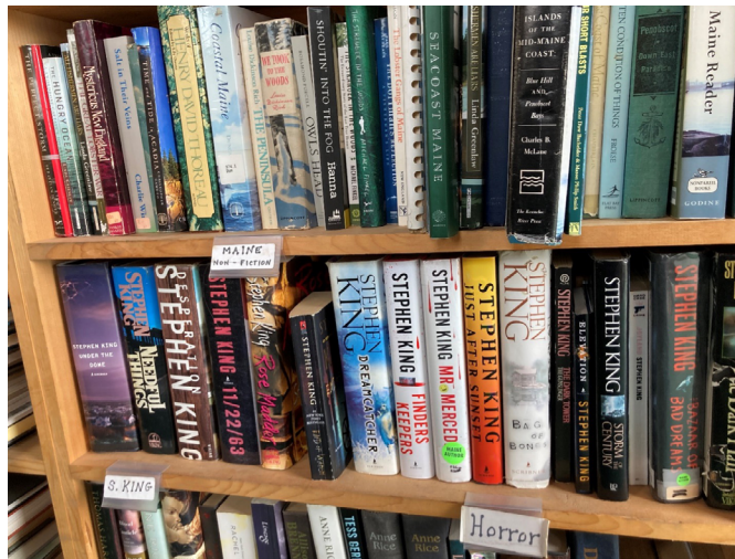
Figure 2: Shelves in Matinicus Island Library with local interest

My duties at the library are usually to pay the electric and telephone bills, to send receipts to anybody who contributes to our nonprofit, and to give the floor a coat of paint once a year—not to write back to people ten states away explaining why we don't really need their 1923 copy of Little Black Sambo for our “banned book project.” This experience has been interesting. If Matinicus Island is going to be in the news, though, I am glad it is for something