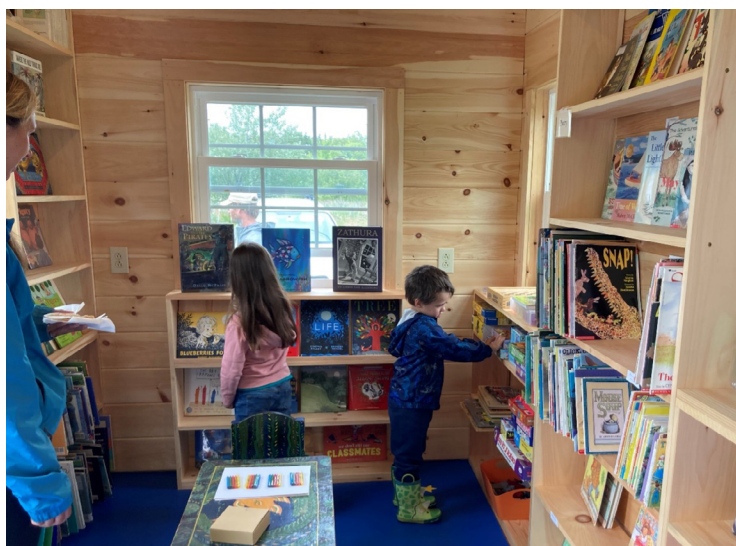
Figure 1: Children's Room at the Matinicus Island Library

This island is located too far from mainland cell towers for cellular phone signal to be reliable, and you can forget about 5G data here. We knew that a wireless Internet hub or hotspot would be welcomed, and the library is centrally located—near the Post Office and easy to find. We had no idea, however, just how much love the collection of books—especially children's