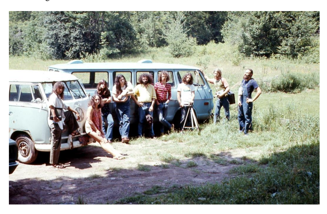
<u>Figure 5.</u> Cultural Data Bank" Radical Software 1.2 (Autumn 1970): 19-20. Copyright Radical Software. Available in the Radical Software Online Archive, Daniel Langlois Foundation, http://www.radicalsoftware.org/volume1nr2/pdf/VOLUME1NR2_art02.pdf

work, its content, audience, and distribution. Any of the other collectives could have been equal heralds (if not better, in the case of Raindance or TVTV) of our always mediated, distributed, and increasingly corporatized present. The most surprising, and ultimately most radical gestures the Videofreex made shifted away from political and experimental content and let go hope for a broad audience across a large network. Instead they focused on the local – and even the banal – to rethink how we get our information and who authors it.