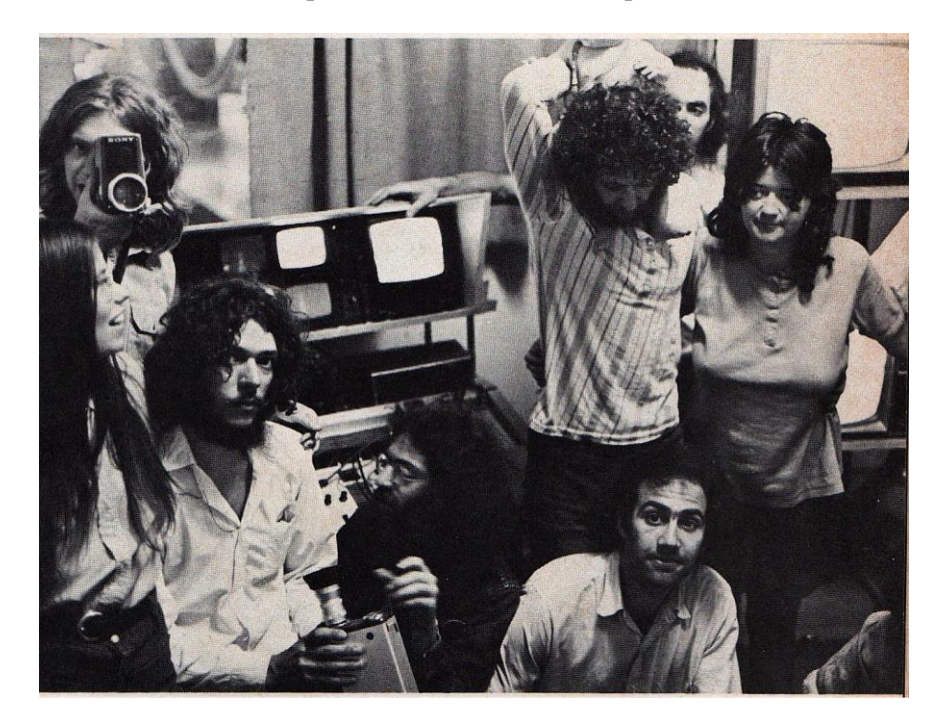
Figure 3. Parry Teasdale photographs May Day protest, 1971.

The filmmakers end with a montage of more contemporary clips of citizen surveillance, from the Rodney King video to cellphone images of protests, riots, and police brutality, intercut with more