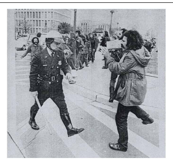
Figure 1. The Videofreex. C. 1971.

In this review of the 2015 documentary, Here Come the Videofreex, the author questions Rasking and Nealon's choice of a traditional chronological approach to a discussion of the importance of the Videofreex, particularly to our contemporary understanding of citizen journalism and the ubiquity of cameras in everyone's back pocket. Instead, Paulsen asks questions about the importance of the Videofreex self-removal from mainstream media to rural New York and their relationship to other radical video collectives of the time.