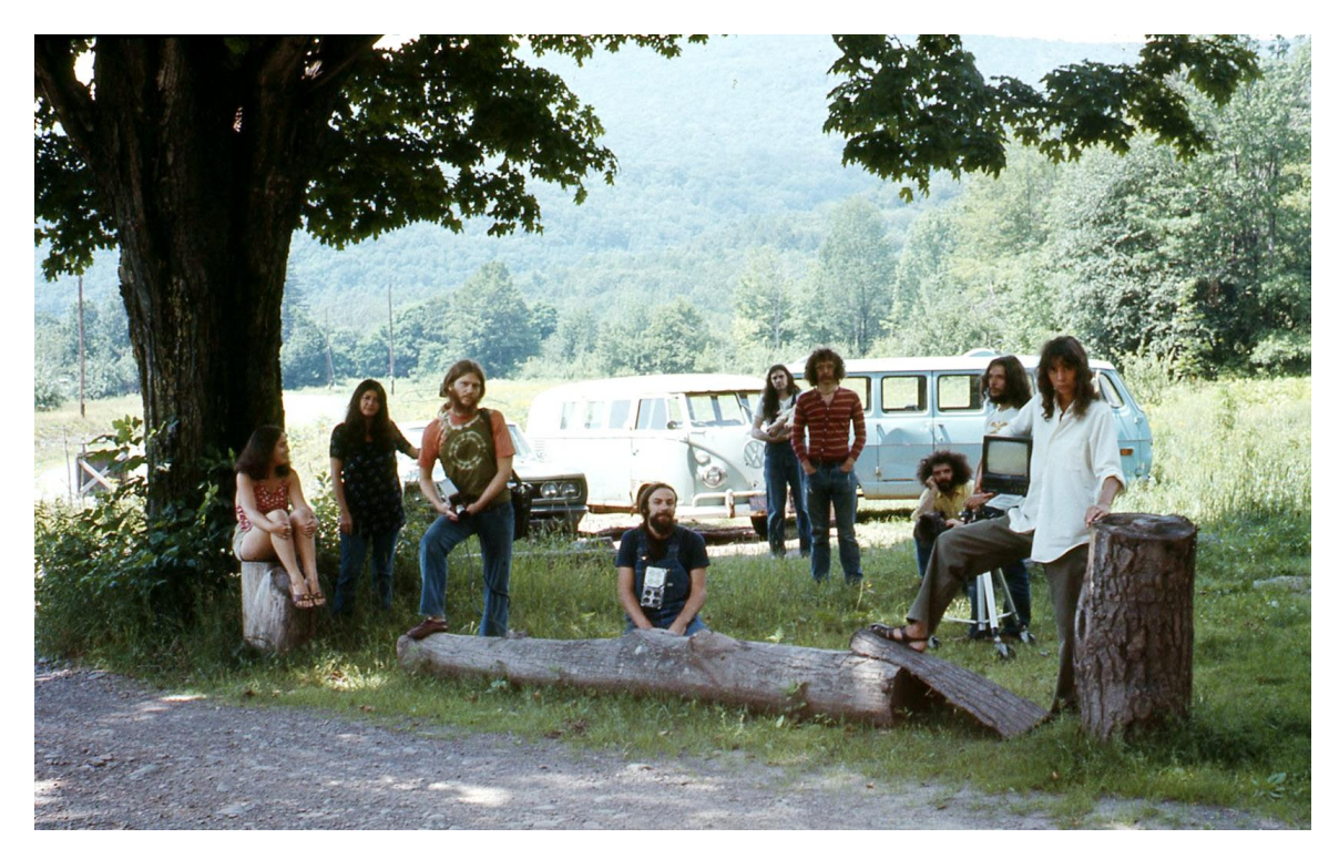
<u>Figure 4.</u> "Feedback" Radical Software 1.1 (Spring 1970): 19. Copyright Radical Software. Available in the Radical Software Online Archive, Daniel Langlois Foundation, <a href="http://www.radicalsoftware.org/volume1nr1/pdf/VOLUME1NR1_art05.pdf">http://www.radicalsoftware.org/volume1nr1/pdf/VOLUME1NR1_art05.pdf</a>

banal bits of everyday life from vlogs and Youtube posts. The conclusion, spoken in the last moments of the film, is that "We are all [now] Videofreex." Surely they are right; we live in a new age of citizen journalism that requires bottom up coverage for our own rights and protection. But to sum up the Videofreex's career as simply the first people to think of recording everything, or mere heralds of a wired and remediated future is to miss the profound arguments lodged in their decision to move from the center of the cultural and video revolutions in New York City to the hinterland fringes, where there was no TV reception, let alone an art world or countercultural public. Ultimately, the strict year-by-year account of the Videofreex work puts emphasis on the content of the early tapes the Videofreex made, rather than on the radicality of their larger gestures, and their innovations in infrastructure and audience, which are lost or at least emptied of transformative potential.