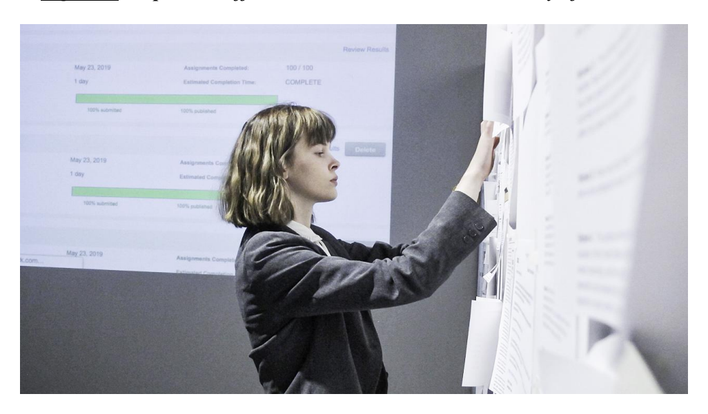
Figure 4. Shepherd's Office at Art Fair Suomi, 2019