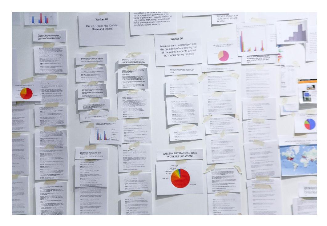
Figure 4. Wall with responses from AMT Workers, 2019

In both name and subject matter, SO exists in close proximity to The Sheep Market (2006) by Aaron Koblin. Only one HIT was registered, which asked the Workers to "draw a sheep facing to the left" for a reward of 2 cents, attempting to show a humanity behind a creative task executed by remote, anonymous, and therefore dehumanized Workers. The symbolism of the sheep and shepherd is relevant to The Sheep Market as well as the namesake of Shepherd's Office . Sheep were one of the first domesticated and the first ever cloned animals, and are a symbol for followers. Furthermore, in the Bible, heroic figures are often referred to as "Shepherds"; Abraham, for example, was a sheep keeper. Another connection to SO 's name emerged with the discovery of an unaffiliated, identically named organisation, The Shepherd's Office, aimed at welcoming those rejected by society for reasons such as "social status, a criminal record, mistakes, misunderstandings, physical appearance, etc." with "encouragement through Bible study and just plain, simple fellowship." The implications of the name similarity and its connotations are purposely left open to readers' interpretations.