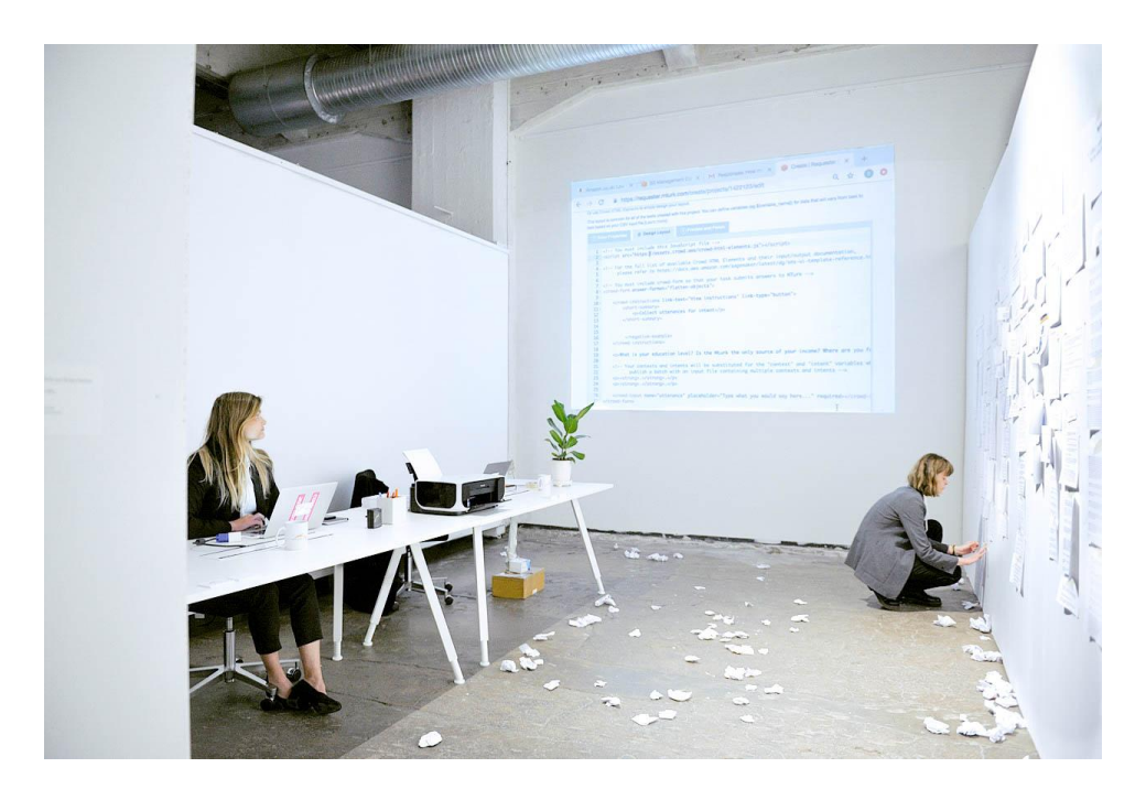
Figure 1. Shepherd's Office at Art Fair Suomi, 2019