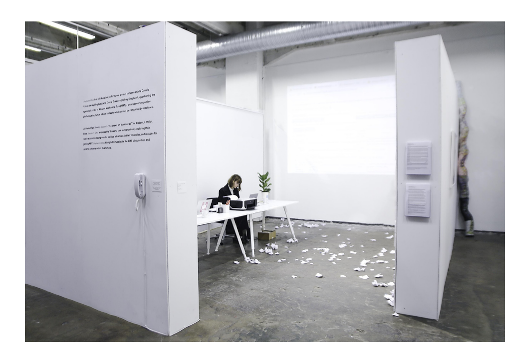
Figure 3. Shepherd's Office at Art Fair Suomi, 2019