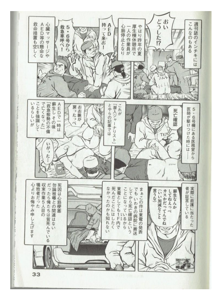
<u>Figure 3.</u> Ichi Efu: Fukushima Daiichi Genshiryoku Hatsudensho Rōdōki (1), 2014, Kazuto Tatsuta, Japanese manga, ©Kazuto Tatsuta (Used with permission)

stories as rhetorical resources for criticizing the weekly magazine and thus validating what he perceived as 'Fukushima.'