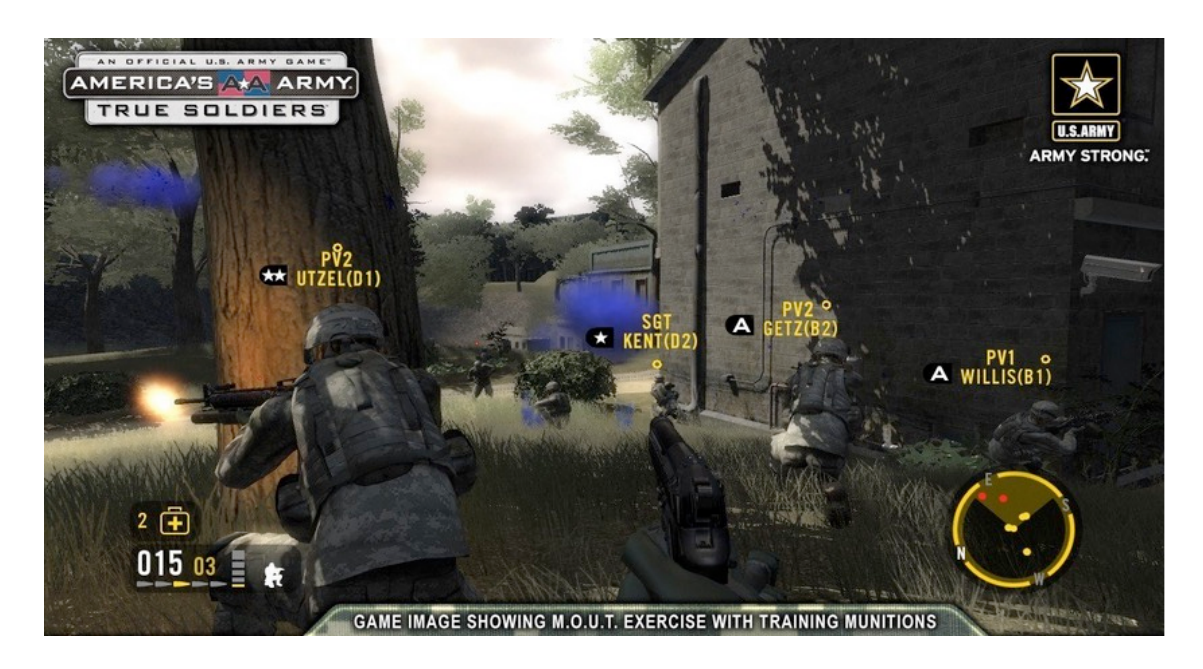
<u>Figure 1</u>. United States Army, Ubisoft, Sega Studios, Red Storm Entertainment, America's Army, 2002-present, screenshot.