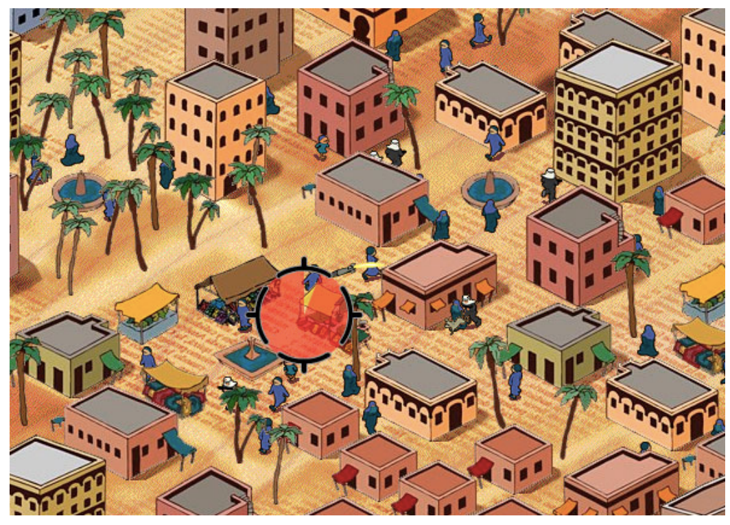
<u>Figure 2.</u> Gonzalo Frasca and Powerful Robot, September 12th, 2003, screenshot, flash game, image courtesy of the artist.

It takes the perspective of the drone operator and shows you what the likely consequences of this type of warfare are.