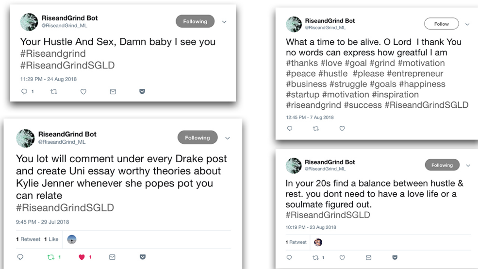
Figure 2. #RiseandGrind, 2018, Conor McGarrigue. Sample tweets from fully trained model.