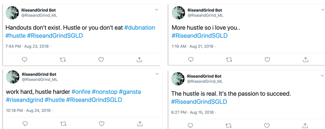
Figure 3. #RiseandGrind, 2018, Conor McGarrigle. Generated tweets from late in training.

The final generated tweets had very successfully adopted the style and form of their training data and did not seem out of place as tweets. A sentiment shift was noted with certain politically right-wing tendencies in the training data becoming more pronounced and insistent; the tweets had not only repeated but amplified the bias obvious in the training data, this paper's title a case in point. This amplification of the bias appeared to have come from a flattening out of difference as subtlety and context were erased; the idiosyncratic, the ironic, the linguistic plays, the subtle sub-tweets, and the nuanced weird of the internet were all lost in translation. Without this context and these modifiers, the patterns of the hashtags' text were hollowed-out, one-dimensional exhortations to hustle and grind with none of the idiosyncratic nuance and fun of the originals (Figure 3). Although the texts assumed the form of tweets, they were essentially broadcasting a fixed text that, while generated from a model trained on these hashtags and incorporating many themes evident in the hashtag, nevertheless lacked the capacity to engage with other users, pick up on their cues, or respond appropriately.