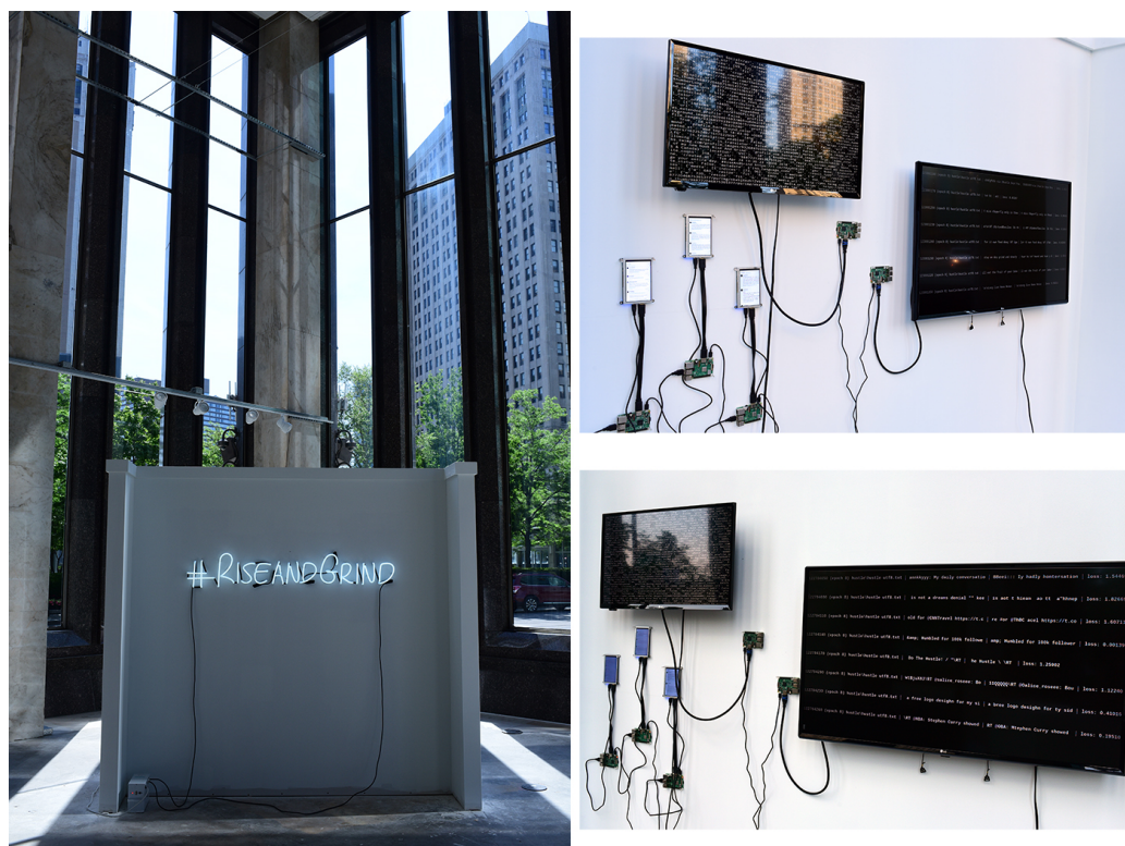
Figure 4. #RiseandGrind, 2018, Conor McGarrigle. Installation view, Science Gallery Lab Detroit.