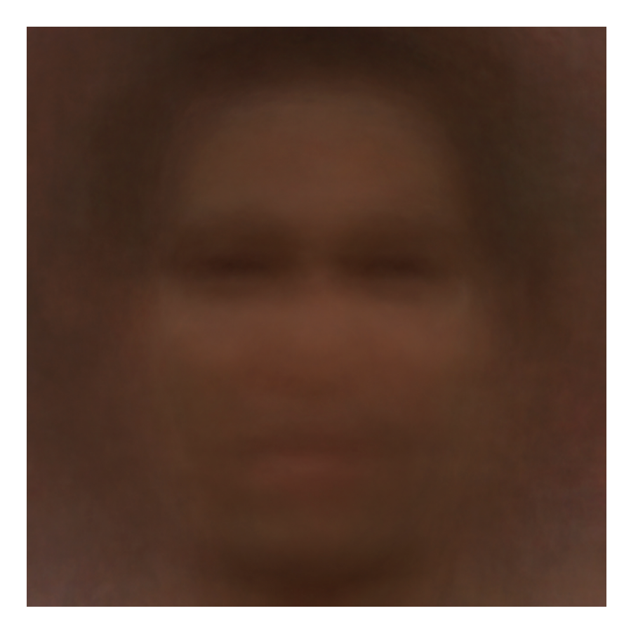
Figure. 1. Do The Right Thing, 2020 © Dennis Delgado.

In my research as an artist, one of the most controversial aspects of facial recognition is that it demonstrates bias with regard to people of color (among other social groups). I am interested in how photography and technologies of vision help to establish and maintain the construct of race, as well as how they bolster existing power structures. Facial recognition is a contemporary iteration of this racist tradition. As an artist I am interested in trying to find forms that encapsulate and expose these issues. What the Dark Database reveals is that facial recognition is yet another cultural form that shapes our imaginations, indirectly telling us what and whom to fear, and ultimately producing a kind of phantasm. What follows is a slightly nonlinear narrative of how the work took shape, what the work reveals, and how a previous project helped establish the foundation for the Dark Database .