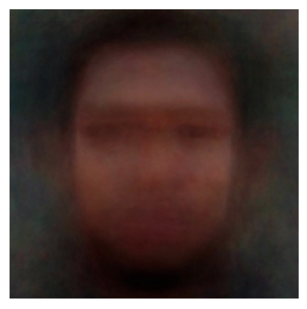
Figure 3. Black Panther, 2020, Dennis Delgado, Tagged Image File © Dennis Delgado.