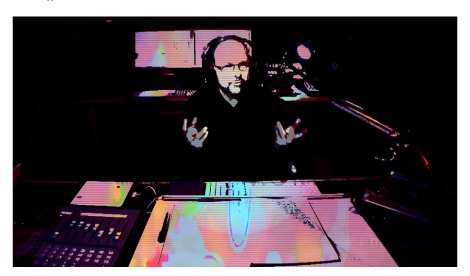
<u>Figure 7.</u> Hand Gestures from The Post Reality Show, 2014, Gif Animation © Randall Packer

"If we could only catch up with the wave of information... we would at last be in the now... to digest and comprehend [its] totality would amount to having reality on tap, as if from a fantastic media control room capable of monitoring everything, everywhere, all at the same time." – Douglas Rushkoff [7]