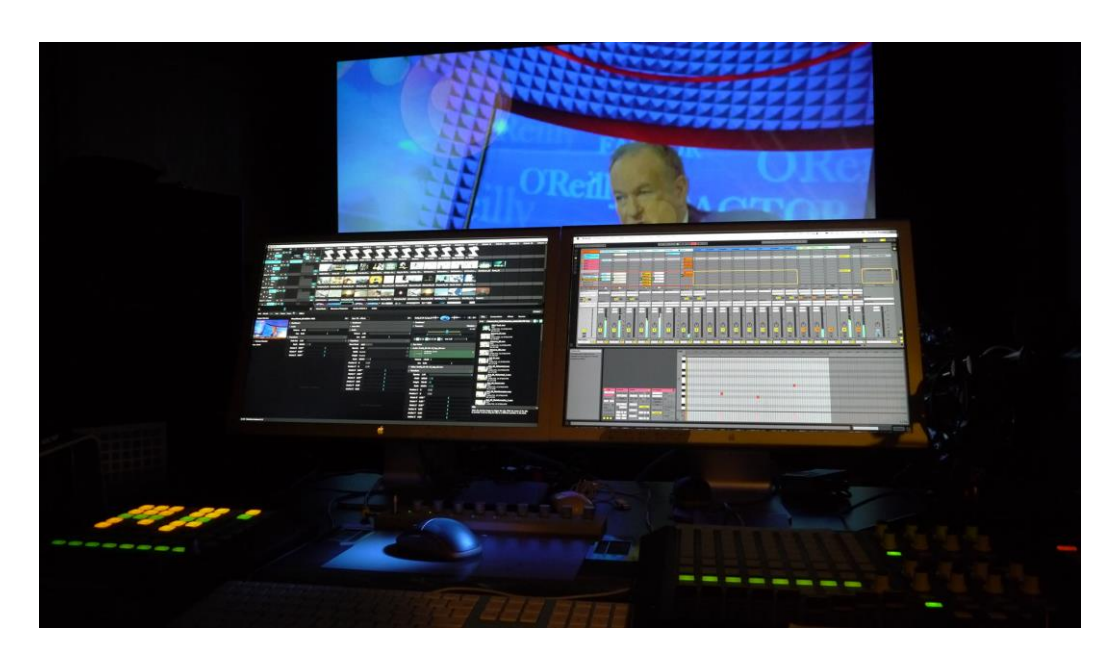
<u>Figure 1.</u> The Underground Studio Bunker from The Post Reality Show, 2011, Photo © Randall Packer

While the mainstream media largely dominate the discourse and narrative of the daily news cycle, we have, since the dawning of the Web some twenty-five years ago, seen this tight grip loosening. The emergence of citizen-journalism via the blogosphere in the early 2000s, followed by the explosive and ubiquitous growth of social media in the late 2000s, has empowered the individual to distribute their own view of events as they see it: anyone with a laptop or even a mobile device might become a broadcaster transmitting an alternative glimpse of the world and its crises. Arab Spring and other recent revolutionary political movements have been catalyzed by independent journalists and millions of citizen activists using social media via the global networks to report on events in the heat of the moment.