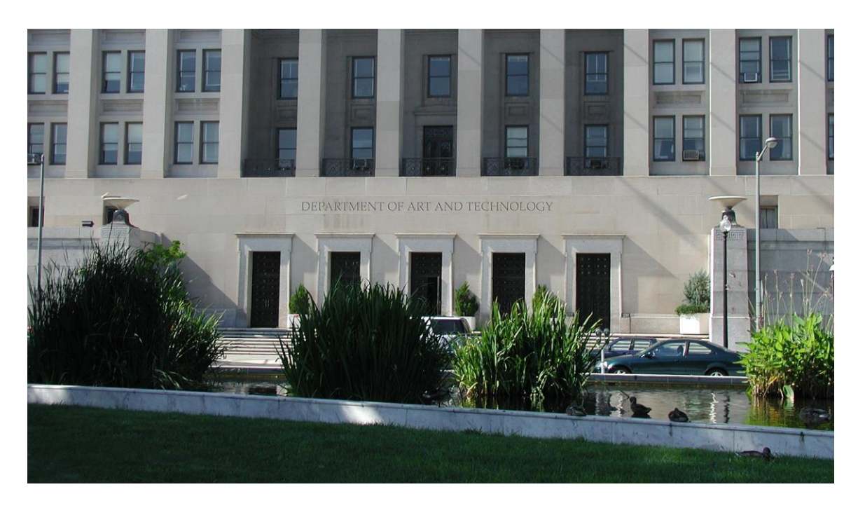
<u>Figure 2.</u> The USDAT Headquarters from The US Department of Arts & Technology, 2002, Photo © Randall Packer

"To prevent undue wreckage in society, the artist tends now to move from the ivory to the control tower of society." – Marshall McLuhan [2]