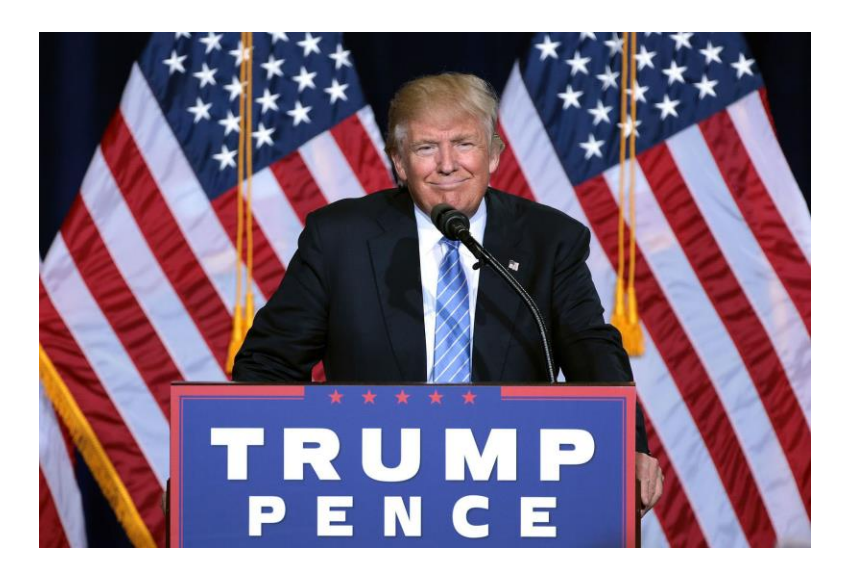
Figure 8. Donald Trump, 2016

"It isn't just about his habit of stating alleged facts that are demonstrably untrue, and continuing to repeat them even after it's been pointed out that they're false, though that's part of it. It's also about the sheer volume of unreality he delivers, as though he's trying to drown us all in a river of bull that moves so fast that truth itself begins to seem almost irrelevant." — Paul Waldman, Washington Post [8]