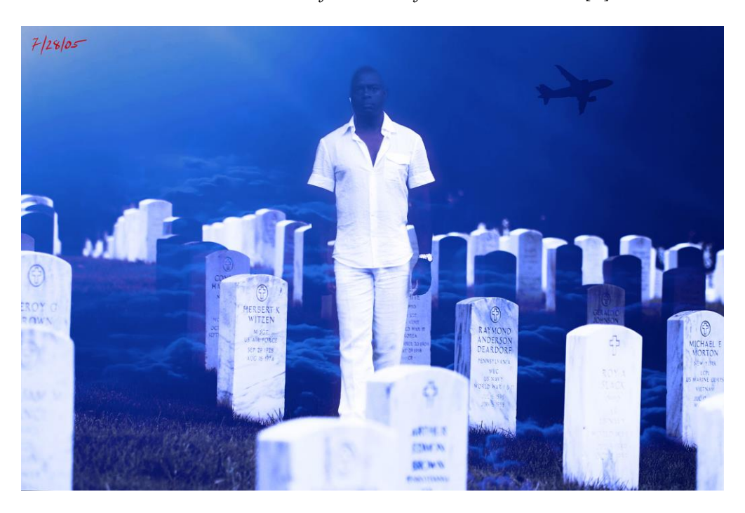
<u>Figure 5.</u> Sometimes I Feel like a Motherless Child from A Season in Hell, 2005, Photo Collage © Randall Packer

"Here are men's memories and the ruins of their beliefs." – Jean Cocteau [5]