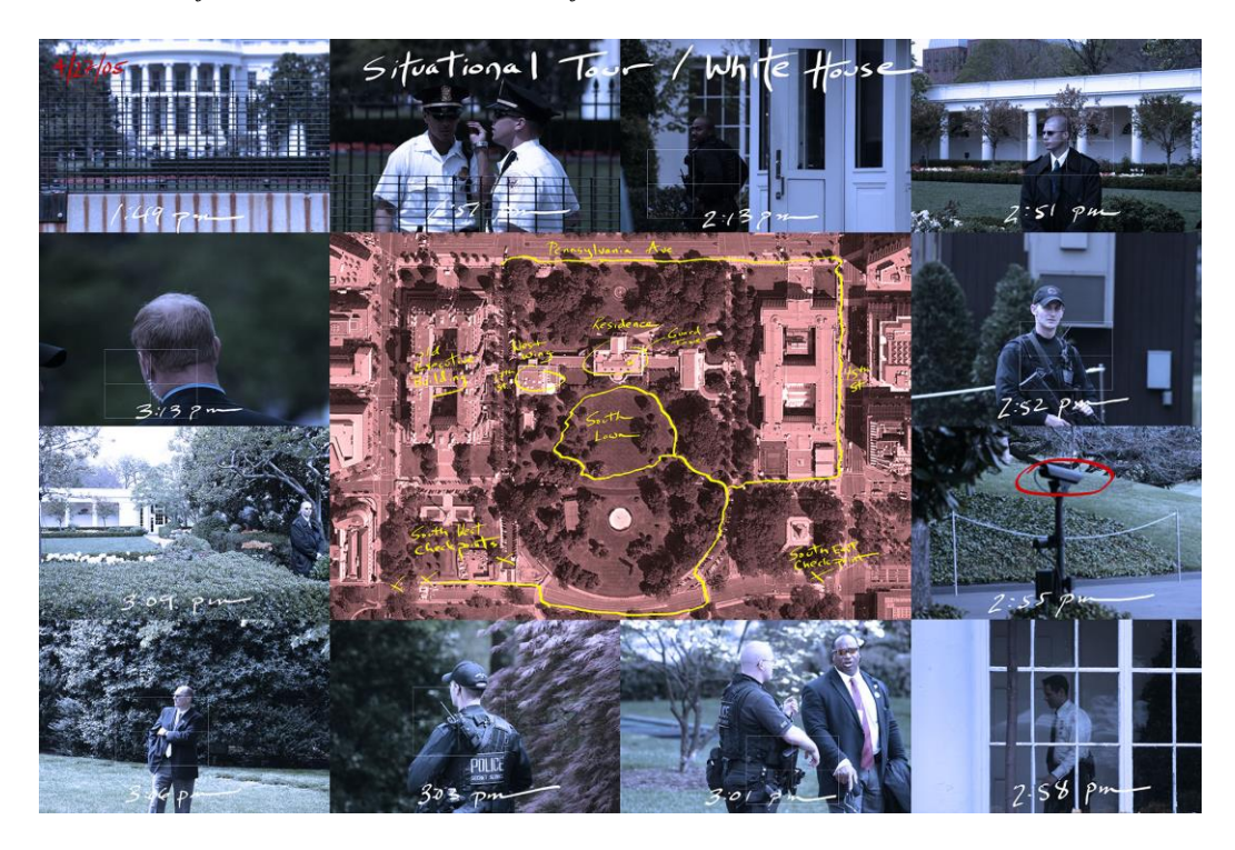
<u>Figure 6.</u> Armed Against Justice from the Blog-Chronicles of the Secretary @ Large, 2005, <u>Photo Collage © Randall Packer</u>

"The invention of the unknown demands new forms." – Arthur Rimbaud [6]