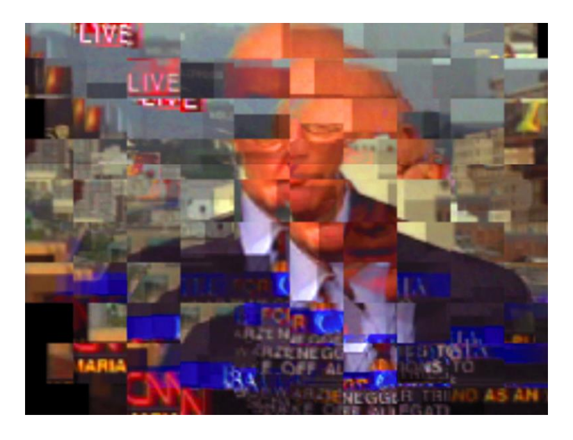
Figure 3. CNN from the Media Deconstruction Kit, 2003, Photo Collage © Randall Packer

"Television can no longer be what it has been for half a century: a place of entertainment or the promotion of a culture; it must, first and foremost, give birth to the world time of exchanges." – Paul Virilio [3]