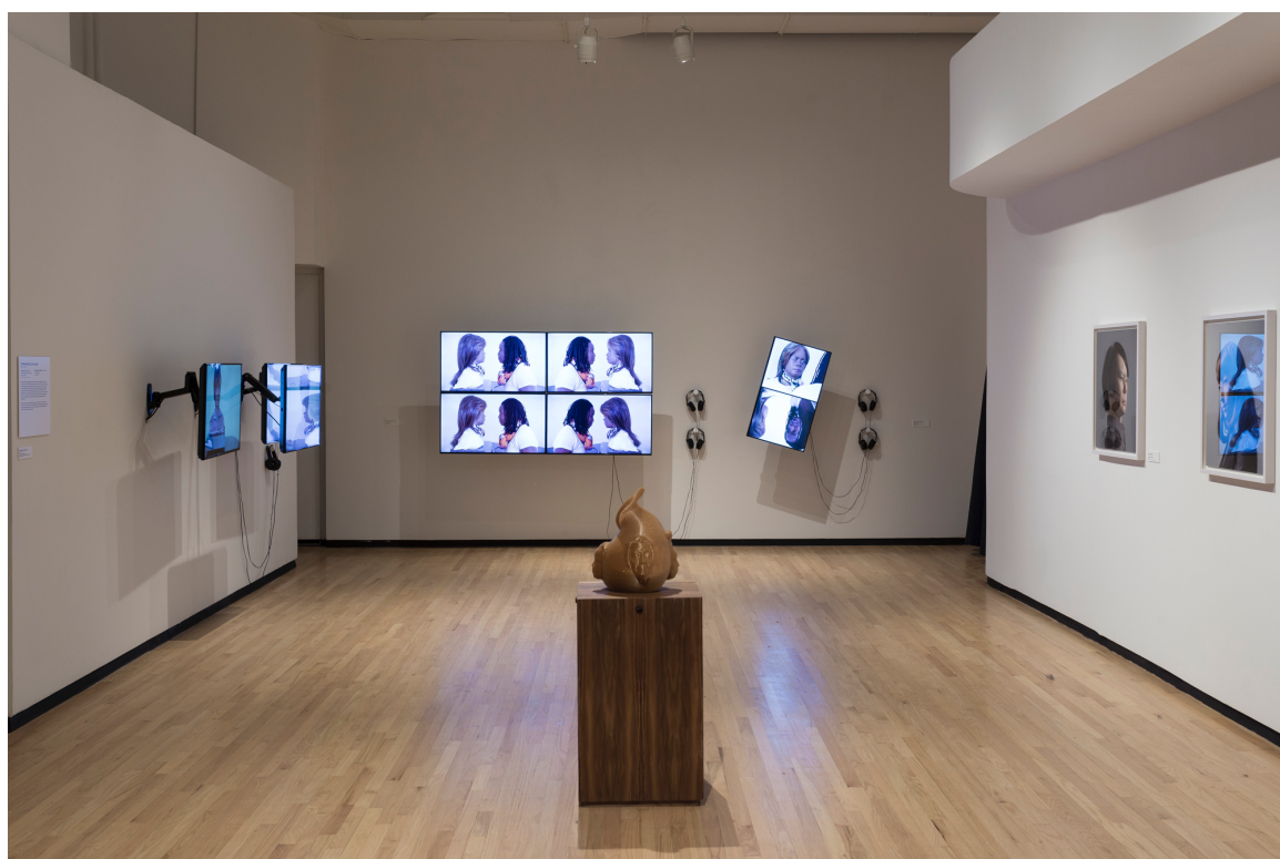
Figure 2. Stephanie Dinkins, Not the Only One (N'TOO), exhibition view, courtesy of the Museum of Contemporary Photography.