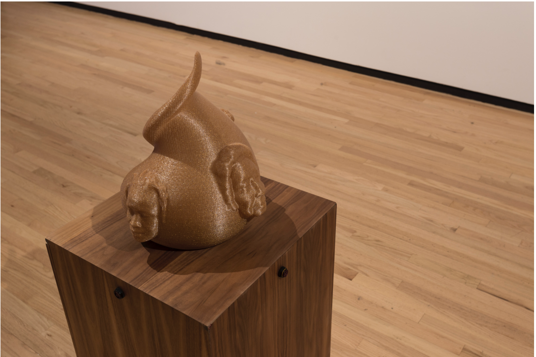
Figure 4. Stephanie Dinkins, Not the Only One (N'TOO), courtesy of the Museum of Contemporary Photography.