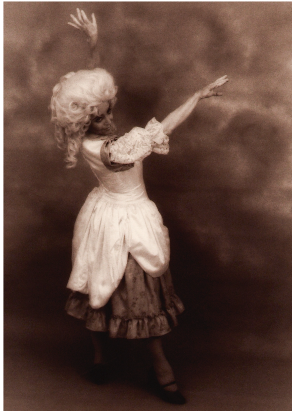
Figure 7. Eleanor Antin being Eleanora Antinova in Before the Revolution from Recollections of My Life with Diaghilev 1919-1929, 1976-78. Tinted silver gelatin photograph. 14 x 11 inches. Courtesy the artist and Ronald Feldman Gallery, New York.

Instead, the artists simply created darker-skinned versions of themselves. For example, in her numerous performances as the white Ballerina and the Black Ballerina Antinova, Antin's skin tone is a slightly darker shade than her own (fig. 7). Her reproduction of herself as the Black Ballerina is cavalier and without concern for verisimilitude.