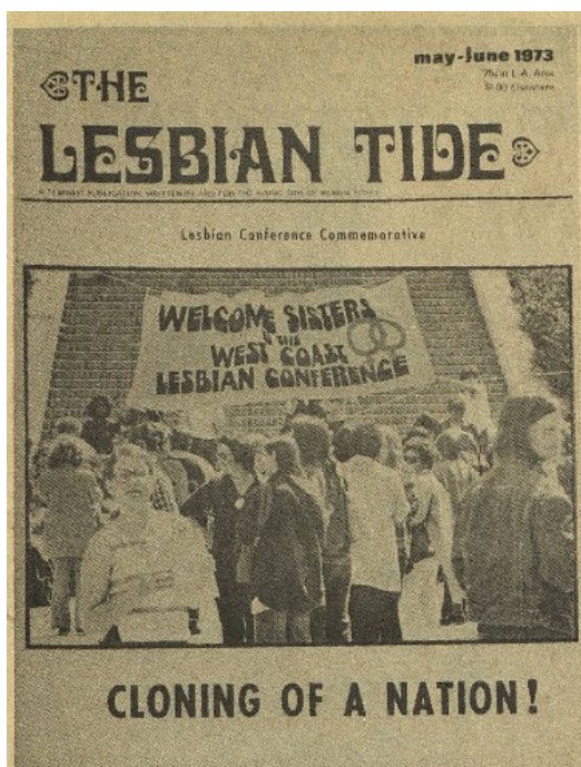
Figure 1. The front cover of The Lesbian Tide, May–June 1973.

different story. 5 It featured a photograph of attendees commingling, laughing, and hanging a banner stating, “Welcome Sisters to the West Coast Lesbian Conference” (fig. 1). It was captioned, “Cloning of a Nation!” Given the popular understanding of a clone as “a person regarded as an exact copy of another” and gay men’s use of the term to refer to themselves as such, we might understand the cover as an erasure of the diversity within feminism that was in evidence at the conference. 6 In equating feminist ties to the familial bonds of sisterhood, or even more extreme, the self-doubling of cloning, the cover appeared to gloss over feminists’ approximate and at times tenuous connection to one another with an appeal to biological likeness.