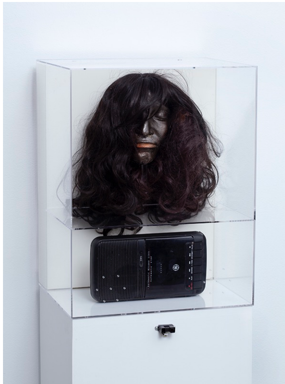
Figure 8. Lynn Hershman Leeson, Self-Portrait as Another Person, 1966–68. Wax, wig, makeup, tape recorder, Plexiglass, wood, sensor, sound. 20 x 15 3/4 x 3 1/8 in / 50.8 × 40.01 × 7.94 cm.

In the case of the blackface Self-Portrait as Another Person (1966–68), race operates as another difference, one possibility among many, both biological and technological (fig. 8). The Breathing Machines are not threatening, however, like the femmes fatales clones in her film Teknolust . Instead, they appear to be sleeping and are awkward in their construction. The wax is inconsistent in texture and the addition of the cassette players results in disjointed figures. Obviously not produced in a standardized industrial manner, these cyborgs are decidedly homemade.