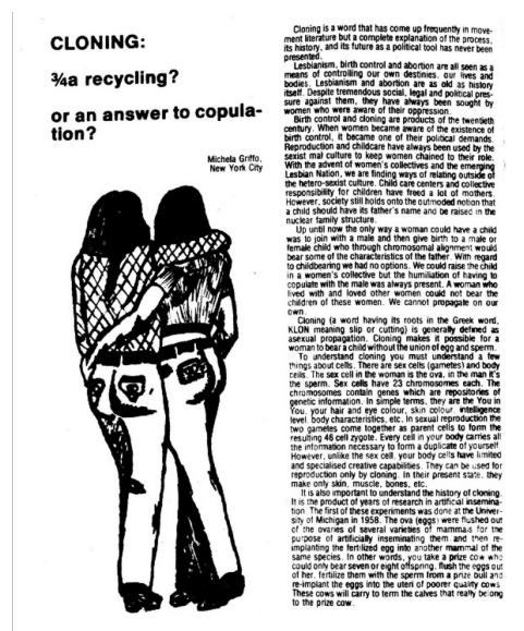
Figure 2. Michela Griffi, "Cloning: A Recycling? Or an Answer to Copulation?," The Circle: A Lesbian Feminist Publication (1974).

over each other (fig. 2). Similarly clothed and echoing one another's stance, they are nevertheless differentiated. The woman on the left has her arm around the other's shoulder, while the woman on the right has her arm around the other's hips. They both wear masculine-reading clothing, jeans and boxy shirts, although one is diamond-patterned and the other striped. The figure on the left has long hair, one strand hanging down her back, while the other appears to have shorter hair. In the context of the article, we are prompted to think of them as either the product of cloning or as a couple who will use cloning to reproduce. In either case, unlike the common understanding of a clone as an identical double, they are similar yet distinctive. Of similar height, walking in stride, it is a loving image. They appear as equals, having abolished the hierarchical structure of heterosexual relationships. For the lesbian feminist community, cloning did not represent the creation of identical conformists, but rather the creation of a loving feminist community through technology. In this context, The Lesbian Tide's "Cloning of a Nation!" pronouncement sounds less like a dystopian science fiction novel and more like a celebration of technofeminist principles.