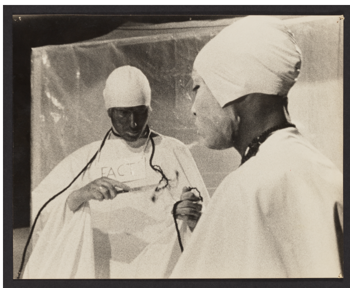
Figure 6. Harold Paris, Fact, 1970. Cinematic directing by Jean-Antoine. Opening event for Voices of Packaged Souls presented at Galerie Withofs, Brussels, 1970. Archives of American Art, Smithsonian Institution.

Within the art world, there was a similar concurrence of artists using blackface. Bruce Nauman’s 1967 series of films transferred to video, Art Make-Up: No. 1 White, No. 2 Pink, No. 3 Green, and No. 4 Black featured the artist shown from waist up in the process of covering his body with the respective paint colors. Nauman later acknowledged the connection to blackface, stating, “And I suppose it had whatever social connections it had with skin color and things like that.” 42 Nauman repeated the theme in his video Clown Torture (1987), in which a white man dressed as a clown in whiteface tells a minstrelsy joke. The Berkeley-based artist Harold Paris made a similar film, Fact (1970), shot in Brussels, Belgium, concurrently with his solo exhibition, Voices of Packaged Souls at Galerie Withofs. The film featured a white man in blackface tied to a Black woman in whiteface (fig. 6). In these performances, the male artists focused on race as a surface difference that could be easily manipulated.