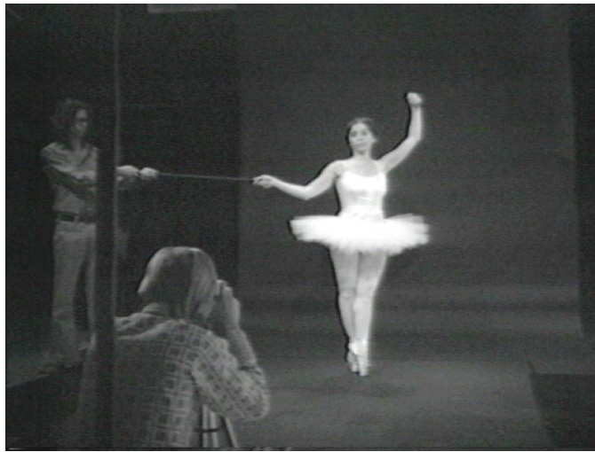
Figure 5. Eleanor Antin, Caught in the Act, 1973. Single-channel video, black and white, sound; 36:00 minutes.

of failure and success in the act of self-reproduction is a topic I address in the following section in conversation with the use of blackface.