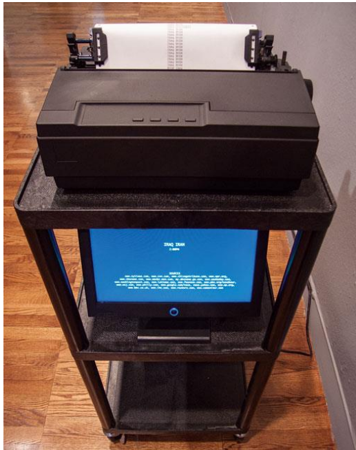
Figure 1. Top Two News Words (By Hour), 2007, Computer/Printer/Paper/Software

The system was built to focus the broad expanse of the 24-hour news cycle into an easily digestible form that would allow an observer to look at it from a distance, as a whole, rather than from the inside where one could easily be overwhelmed. The resulting installation, while seemingly cold and mechanical with its monochrome computer display, impact printer and continuous paper sheet with monospaced text, fostered introspection in the viewer and initiated discussion among groups of observers: “ Why the word MEGA? ”- “ Oh, someone won the lottery ”; “ What happened in Japan? ”- “ A reactor leaked. ” Dialogue that had disappeared because we had begun to consume our media in digital isolation was rekindled by an inert collection of the very technologies that created this isolation.