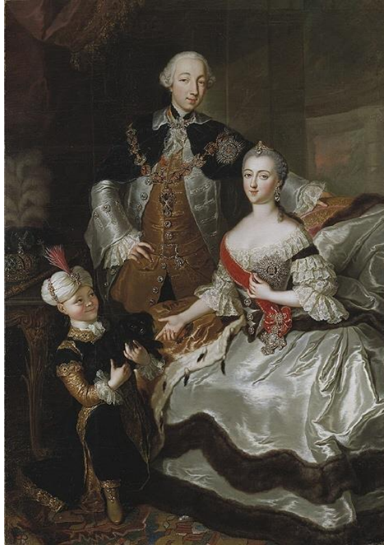
Figure 7. Anna Rosina Lesiewska, Peter III and Catherine II of Russia , 1756. Oil on canvas, 207 x 143 cm. National Museum, Stockholm, Sweden.