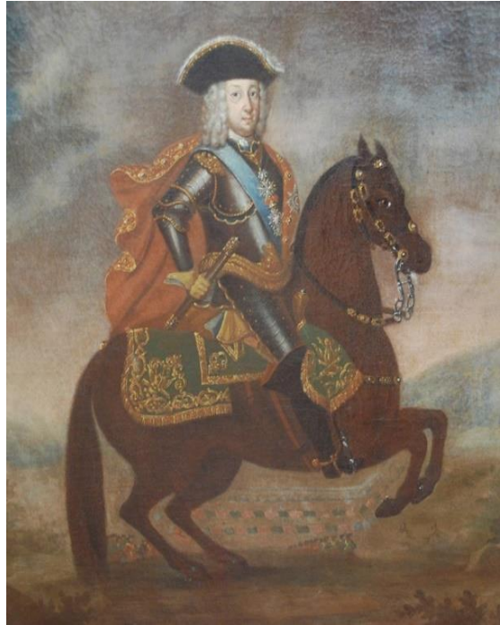
Fig. 2. Ivan Argunov (after Karl Schurmann), Field Marshal Count Boris Petrovich Sheremetev , 1753. Oil on canvas, 88 x 71 cm. Kuskovo, Moscow.

or prints rather than composing his own work and painting from life. 19 The result was work that often had an archaic effect, including dull colors and a flattening of pictorial space. A portrait of Field Marshal Boris Petrovich Sheremetev, completed by Argunov in 1753 after a circa 1710 precedent by Karl Schurmann, shows the late field marshal on horseback in front of a military landscape (Fig. 2). As in Schurmann's original, the anatomy of man and beast is awkwardly drafted, and the background is shallow. Although Argunov's other paintings displayed the full extent of his technical skill, here he deliberately copies the visual idioms of Petrine Russia in order to evoke the Sheremetev family's illustrious past.