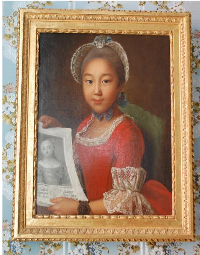
Fig. 1. Ivan Argunov, Anna Nikolaevna Kalmykova , 1767. Oil on canvas, 62 x 50 cm. Kuskovo, Moscow.

The portrait's skillfully painted surfaces and intricate composition reflect elite social signaling, but also record an encounter between two unfree people in Catherinian Russia. Argunov was a "household" or enserfed painter of the Sheremetevs, one of Russia's wealthiest princely families. Kalmykova, who was the Sheremetevs' ward, was one of many Kalmyk children removed from their families in Central Russia by Russian soldiers. Her portrait, with its many layers of representation and allusion, is an extraordinary example of a genre that was relatively new to Russia. Demonstrating attention to what could be called individual, personal, or familial, it simultaneously enmeshes its subject (as well as Argunov himself) within the political hierarchies of imperial Russia.