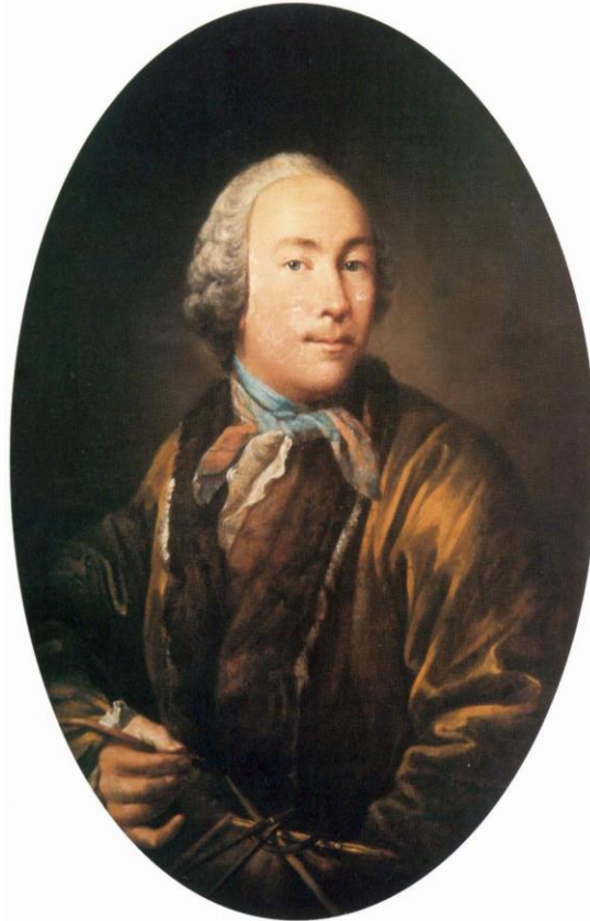
Figure 11. Ivan Argunov, Portrait of an Unknown Artist (Self-Portrait?) , late 1750s—early 1760s. Oil on canvas, 83 x 64 cm. State Russian Museum, St. Petersburg.

The question of Argunov's freedom to compose is complicated by the existence of a later portrait by Nicolas Benjamin Delapierre, a French artist active in Russia (Figure 12). Delapierre's painting shows a young girl in the same pose as Kalmykova, holding another fictive print of Grooth's 1746 portrait. The identity of the sitter in this painting is unclear since she looks dramatically different from Kalmykova. The painting has sometimes been referred to as a portrait of Ekaterina Borisovna, another Kalmyk child who arrived with Kalmykova when she began living with the Sheremetevs, but this is unlikely because Ekaterina Borisovna soon left to live with another family. Letters between Kalmykova and the Sheremetevs mention her, but Kalmykova is frequently asked to convey their best wishes to Ekaterina Borisovna, suggesting that they were not in touch with her to the same extent. 49 So the portrait does seem to be Kalmykova, an identification strengthened by Selinova's observation that a portrait of Kalmykova in a "round, oval frame" is mentioned in Kuskovo inventories. 50 It is possible that Delapierre had only a verbal description or a sketch of the original, and took liberties with Kalmykova's likeness.