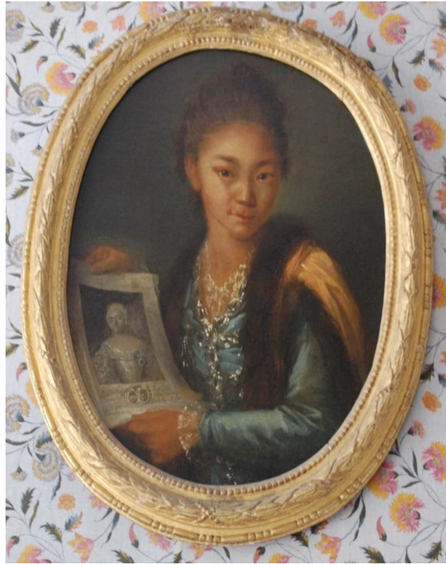
Figure 12. Nicolas Delapierre, Anna Nikolaevna Kalmykova (Ekaterina Borisovna?) , 1772. Oil on canvas, 61.5 x 50 cm. Kuskovo, Moscow.

The fact that the Sheremetevs commissioned a version of the portrait from a French painter might seem like a dismissal of Argunov's work, if this is indeed Kalmykova and the painting was intended to replace or update the earlier version. 51 If this were the case, the prestige of a French portraitist would prove to be valued more than the work of an enserfed artist. But on the other hand, it can also be interpreted as a compliment to Argunov's originality; this composition clearly conveyed what the Sheremetevs wished it to. Delapierre copied the essentials of Argunov's portrait, changing little except the girl's clothing (and, oddly, her facial features). Argunov's original must have been deemed perceptive enough to instruct the foreign artist how to depict Kalmykova's unusual social circumstances. Argunov had already worked out how to portray the child using visual cues from his own prior work and from other family portraits; Delapierre, an outsider, copied these strategies.