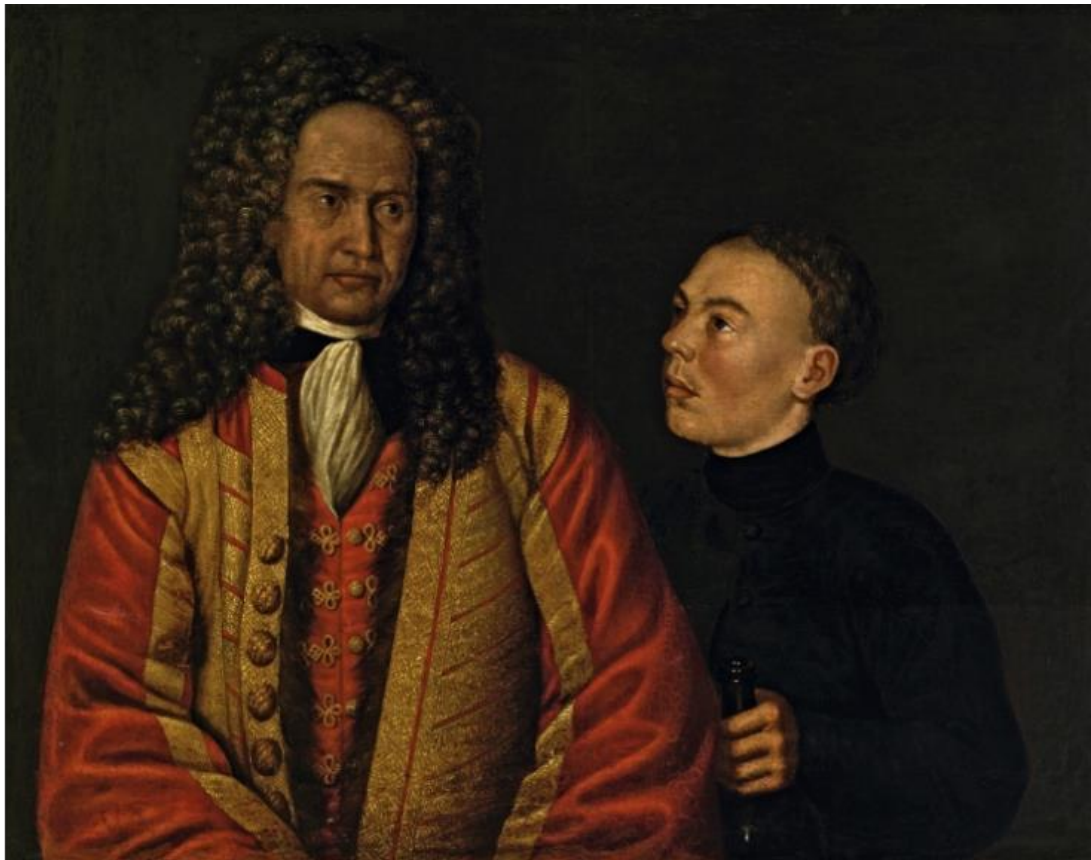
Figure 6. Unknown, Portrait of Aleksei Lenin and a Kalmyk , before 1707, oil on canvas, 89 x 116 cm, State Russian Museum, St. Petersburg.

wig. Whether a servant or enslaved, he plays the role of a subordinate in this portrait; Lenin's power over him is instantly clear. A portrait of Catherine II from 1756 by Anna Rosina Lesiewska uses the presence of a child, possibly a Kalmyk page who took care of Catherine's dogs, in a similar way (Figure 7). 43 The boy kneels at Catherine's feet, gazing up at her as he holds her spaniel. As these examples show, during the rare instances in which Kalmyk people appear in Russian portraiture in the eighteenth century, they are not only anonymous subordinates to the named subject of the image but are sometimes even equated with animals at the feet of elite Russians. Argunov's portrait of Anna Kalmykova is composed very differently from these precedents; she dominates the full space of the painting instead of being pushed to the margins. But the painting nonetheless makes clear that she is socially subordinate to members of the Sheremetev family.