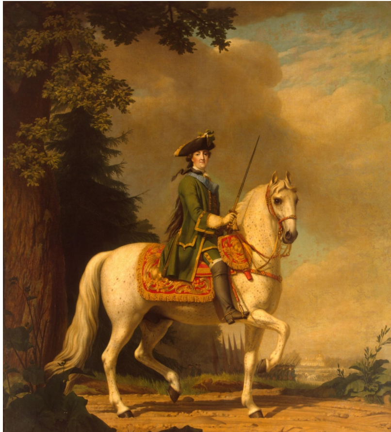
Image 4: Vigilius Eriksen (Ericksen). Equestrian Portrait of Catherine II , Denmark, after 1762. Oil on canvas, 195cm x 178.3cm. Inventory Number GE-1312.

"The empress led the regiments herself dressed in the Preobrazhenskii Life Guards uniform, on a white horse holding a drawn sword in her right hand." 10